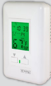
HWP120 Programmable For Hydronic Heaters HWPT120 Programmable Adds Timer for Pump