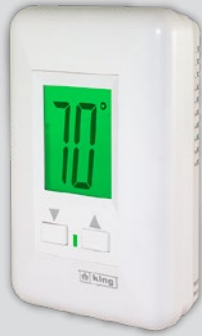
HW120 Non Programmable For Hydronic Heaters